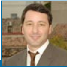
DHI Northern California, Clinic Director