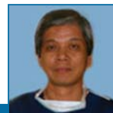
DHI Group Medical Director