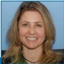
DHI Athens, Greece Member of DHI Certified Medical Team